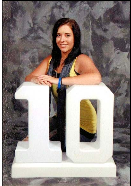
School News Editor