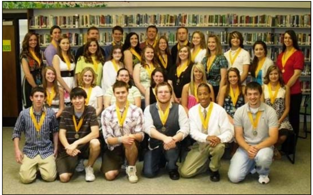
Above, the 2010 Senior Scholarship and Award Recipients