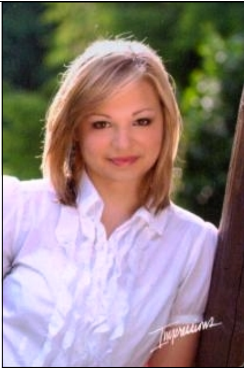
Senior Spotlight Editor